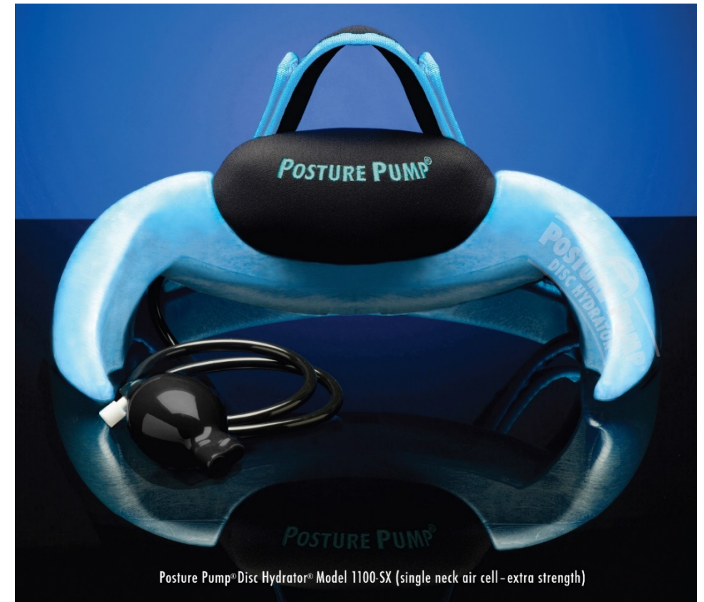
Posture Pump® Disc Hydrator® Model 1100-SX (single neck air cell - extra strength)

Copyright 2017 POSTURE PRO, Inc. • U. S. Patent Numbers 5,713,841 • 5,906,586 • D508,566S • 7,060,085,B2 • 8,029,453,B2 • 8,734,372 • 8,764,693 • 9,095,419 • 9,241,820. Other patents pending. Consult your health care professional before beginning. Prices and colors subject to change without notice. Posture Pump® products are not designed to diagnose or cure disease. Posture Pump®, Neck Pump®, Back Pump®, Scoligon®, Disc Hydrator®, Dual Disc Hydrator®, Penta Vec®, Expanding Ellipsoidal Decompression (EED®), Elliptical Back Rocker™, Decompress, Shape & Lubricate™, Be Flexible, Stand Taller, Feel Younger™