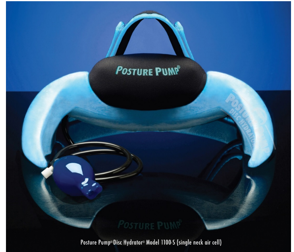
Posture Pump® Disc Hydrator® Model 1100-S (single neck air cell)

Copyright 2017 POSTURE PRO, Inc. • U. S. Patent Numbers 5,713,841 • 5,906,586 • D508,566S • 7,060,085,B2 • 8,029,453,B2 • 8,734,372 • 8,764,693 • 9,095,419 • 9,241,820. Other patents pending. Consult your health care professional before beginning. Prices and colors subject to change without notice. Posture Pump® products are not designed to diagnose or cure disease. Posture Pump®, Neck Pump®, Back Pump®, Scoligon®, Disc Hydrator®, Dual Disc Hydrator®, Penta Vec®, Expanding Ellipsoidal Decompression (EED®), Elliptical Back Rocker™, Decompress, Shape & Lubricate™, Be Flexible, Stand Taller, Feel Younger™